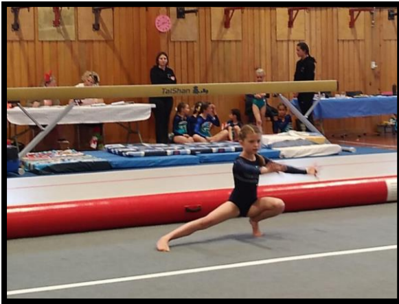
Above: Georgia in action on the floor